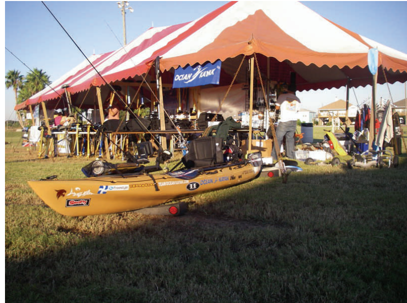
Fully rigged tournament kayak on display

Team Ocean Kayak participated in the 2nd annual Everything Kayak expo in Aransas Pass. The team provided seminars on catch fish along the Texas coast as well as how to clean your catch. Team Ocean Kayak also provided kayak safety classes and paddle tours during the two day event. Team Ocean Kayak helped out Wind and Wave of Corpus Christi with answering question from customer about kayaks and kayak gear. The weather was great and the crowds were on hand with plenty of questions. Team Ocean Kayak was also there to celebrate TexasKayakFisherman.com's 10,000 member, a great milestone for a wonderful community of kayakers. Team Ocean Kayak was definitely in their element and drew crowds where ever we were at the site. We look forward to participating again at next year's event.