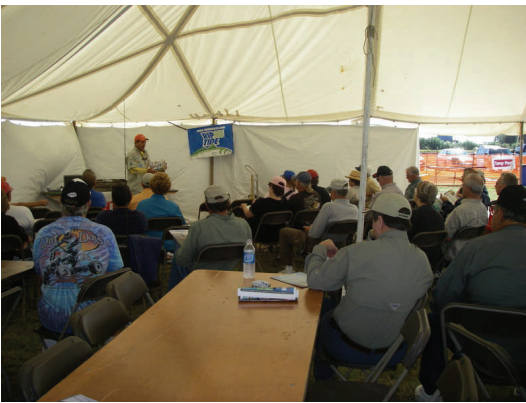
Fil's presentation to a packed house