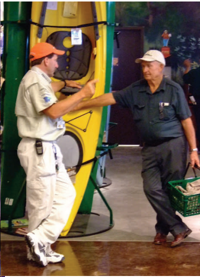
Fil talking kayaks