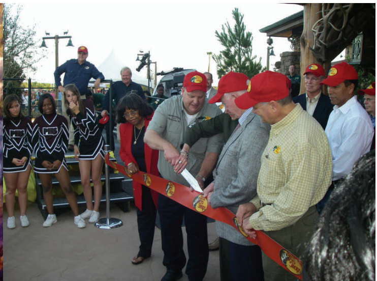
Ribbon cutting ceremony