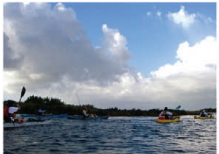
Beautiful day for a paddle