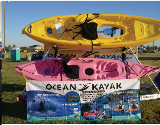
Kayak Trailer on display