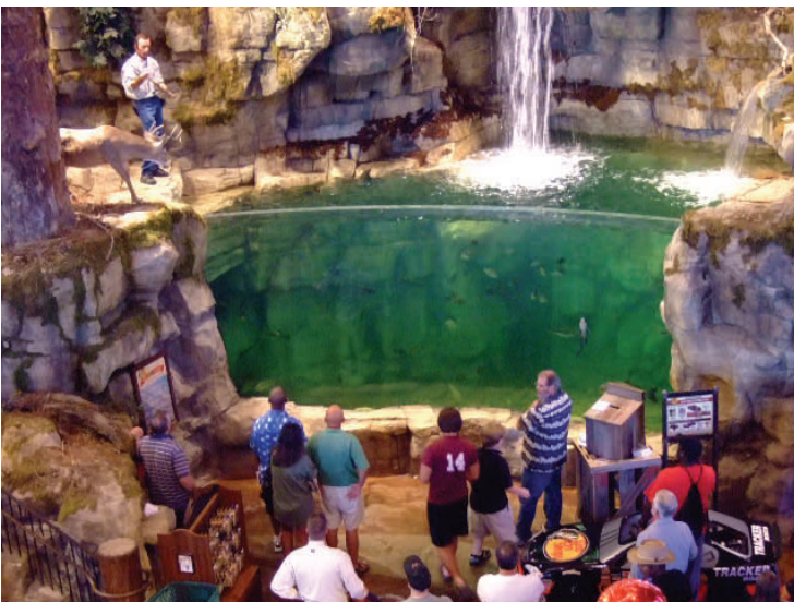
Vincent catching bass and talking fishing