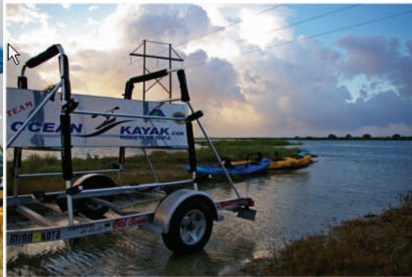
Preparing for launch